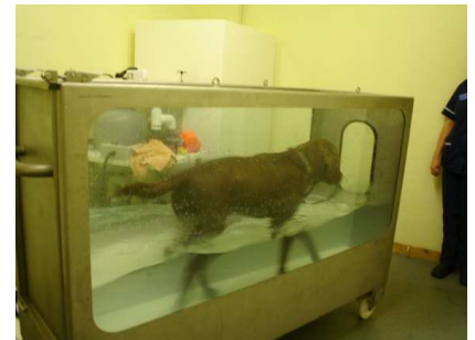
The water walker in action