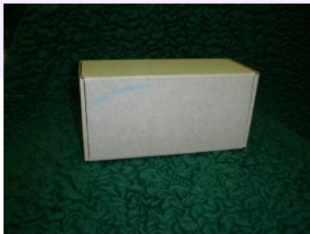
Plain card scatterbox