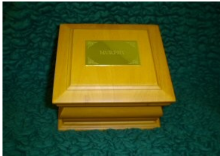
Wooden casket with brass plate